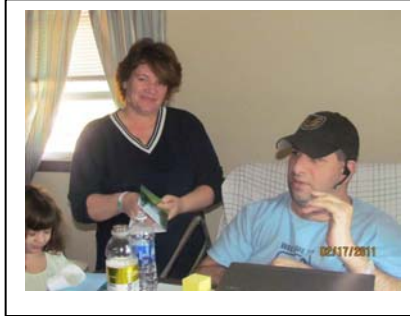
Opening Gift Cards