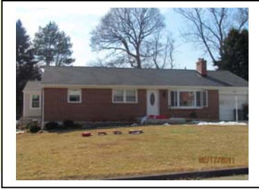
502 Westview Road