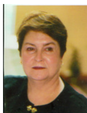
Silvia Rodriguez - 2011 State Governor